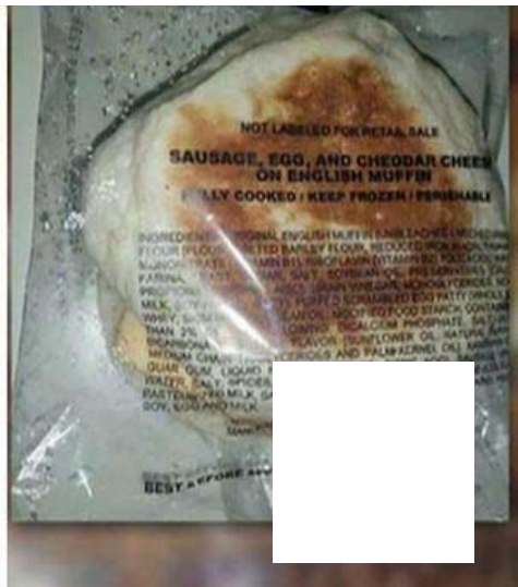
NOW PLAYING Starbucks recalls sandwiches over listeria concerns

Breakfast sandwiches sold at 250 Starbucks stores have been recalled by the U.S. Food & Drug Administration (FDA) for potential listeria contamination.