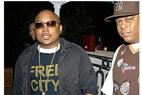
'Shark Tank' judge: What I learned from a $6M mistake