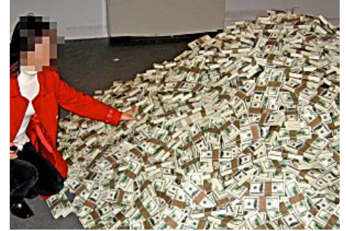
Homeowners Who Have Not Missed A Payment in 3 Years Are In For A Big...