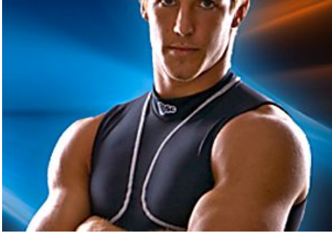
Elite Trainer Reveals How To Build Muscle Quickly & Safely Home - NY TRI EXPO '16