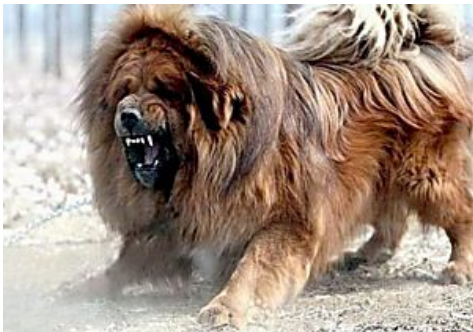
The World's 25 Most Dangerous Dog Breeds - #3 Was Not Expected