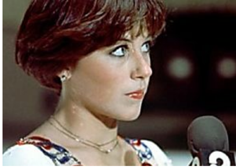
Do You Remember these Star Athletes? They Are All Flat Broke Now